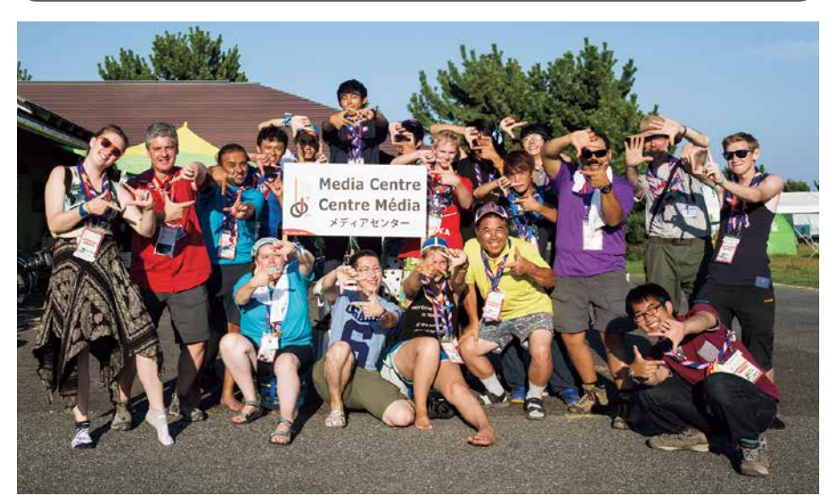
Just some of the Jamboree Photo Team who provide images for this Newspaper. Thanks Team!